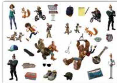
With Bright & Fun Stickers!